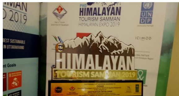
Himalayan Tourism Samman Trophy

CHINAR felicitated with Himalayan Sustainable Tourism Samman 2019 by PHD Chamber of Commerce, UNDP and Uttarakhand Tourism Development Board for Developing Sustainable Tourism site in Uttarakhand.