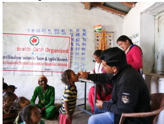
Health & Nutrition camp in rural Bageshwar

CHINAR and Vitamin Angels has partnered together to serve the communities and meet their nutritional needs. As part of this project, Vitamin A, deworming and multi-vitamins