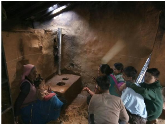
Construction of smokeless energy efficient stove

Capacity development workshop on clean and energy efficient smokeless cook stoves made from locally available material is being given to the community in Uttarakhand. Mainly women are being trained so that they can construct their hearth after return. The stoves are constructed using stone, red soil, and cow dung. Chimney is prepared from tin can. These stoves has provision of two pots and can save fire wood by 40% which minimizes pressure on the adjoining forest.