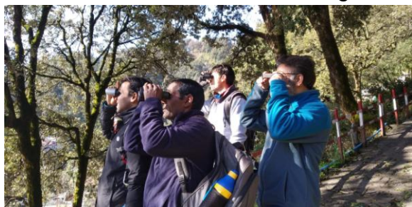
Bird watching course

We have also designed environmental learning expeditions for school students and citizens which people can join.