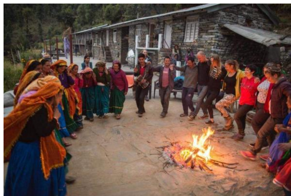
Tourist learning traditional dance from villagers during their home stay

migration from the mountains. It is also to promote the ecological and cultural heritage of the Himalaya among the tourists.