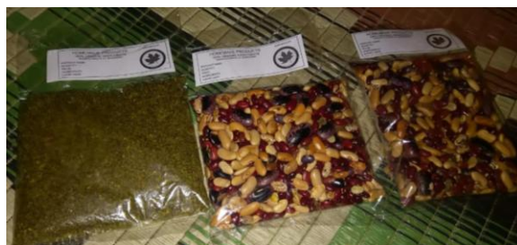
Packaging and branding of local products

We are developing rural enterprise through value addition, branding and marketing. Organically grown pulses, spices, pasteurized butter and flavoured salt is being packaged and marketed in local markets.