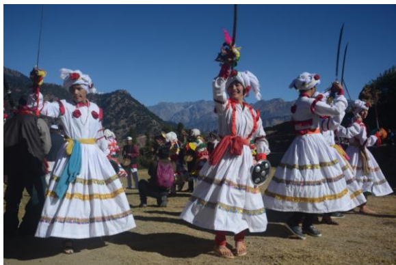
IMD celebration 2019

United Nations has declared 11 th of December as International Mountain Day (IMD). We have been celebrating IMD since 2017 to promote the cultural and ecological heritage of the Himalaya. Cultural folk dance, agro-biodiversity, food and handicraft of indigenous mountain communities