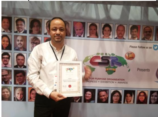
CHINAR Chairman with World CSR Certificate

CHINAR awarded with Certificate of Merit at the World CSR Congress in Mumbai on 18th of February 2018 for its work in sustainable mountain development in the Indian Himalaya.