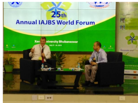
CHINAR participation in International Conference

Bhubaneswar for Sustainability Development Programme (SDP) and Wipro Foundation as part of their Earthian Sustainability Programme. Each year students from XSoS and from other management and law colleges come to CHINAR for internship which is part of their credit course. Till date fourteen students have completed their internship's with us. Five published and presented their study in International conferences.